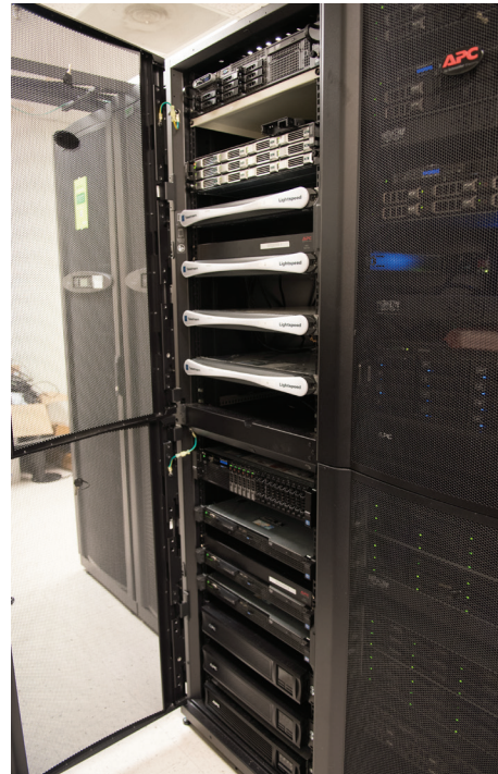
Lightspeed servers accelerate media processing

To get more information about Telestream or products mentioned, call 1-530-470-1300, or visit www.telestream.net